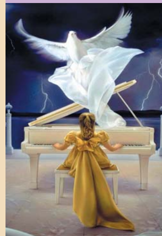
Cover Art Flight of Music by Jean-Paul Avisse

For further information, contact Prestige Art Galleries, 3909 W. Howard, Skokie, IL 60076. (874) 679-2555, www.prestigeartskokie.com